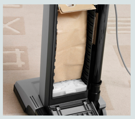
The dust bag is 'universally' sized and is easy to interchange