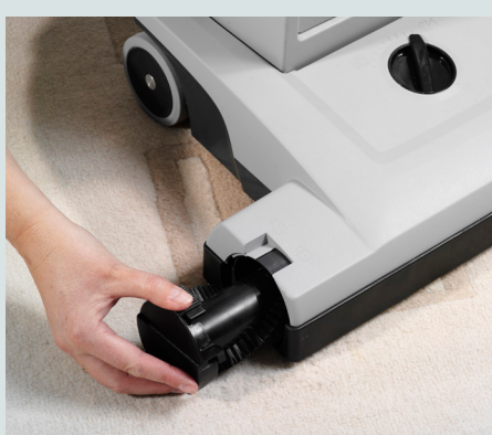
The brush is easily accessed without the need for tools for easy replacement, maintenance and cleaning