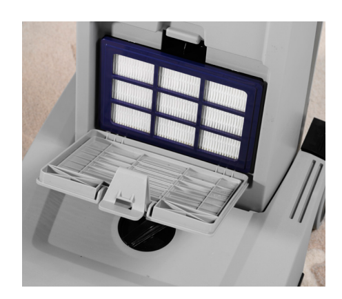
A HEPA 13 filter is optional for all models in this series so that the machine can be used where maximum dust filtration is required