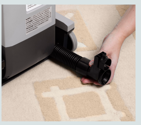
Easy access to suction hose for removal of any blockages that may arise