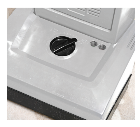
Indicators guide the user