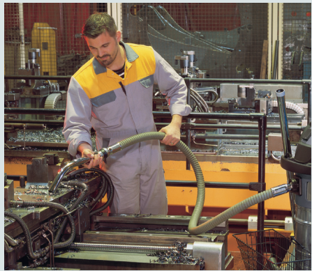
For fast pick-up of either liquid or powder spills, or for specific applications such as metal chip removal, the Nilfisk IVB range of industrial vacuums is the smart choice.