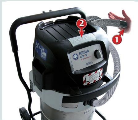
With Push&Clean, all you have to do to clean the filter, is to cover the fitting or the hose and press the button. Powerful air pulses will clean the filter gently, and you are back to work in no time.