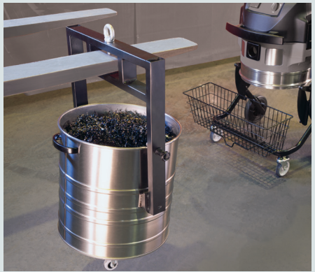
The optional forklift device helps you to empty the container and saves back strain