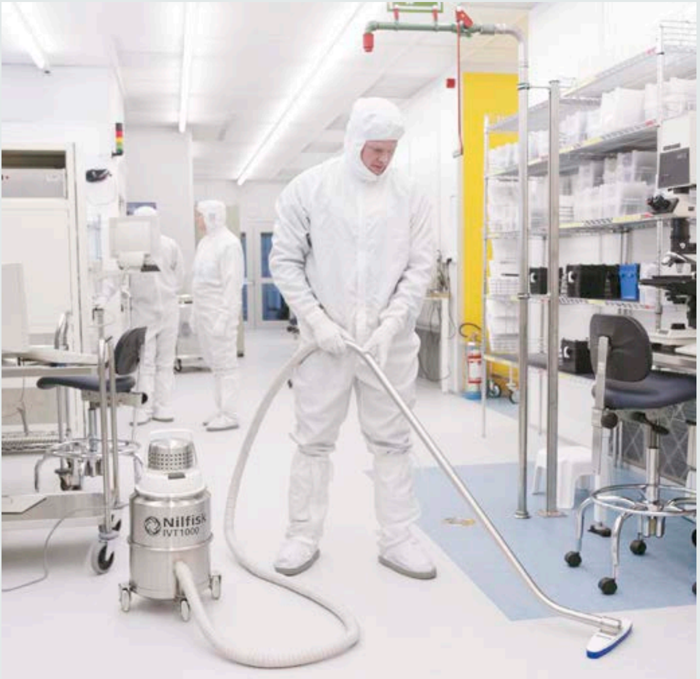
Maximum sterilization and full contamination control