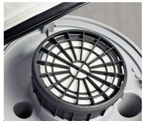
Higher filtration level with HEPA filter (VP300 HEPA)