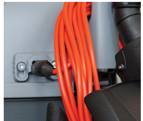
Detachable orange cord (VP300 HEPA)