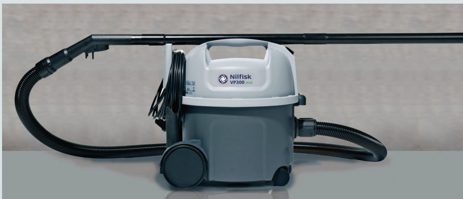
VP300 can be carried safely and comfortably in one hand