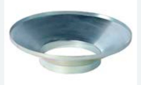
Removable cyclone that protects the primary filter from becoming in direct contact with incoming liquids or sharp objects