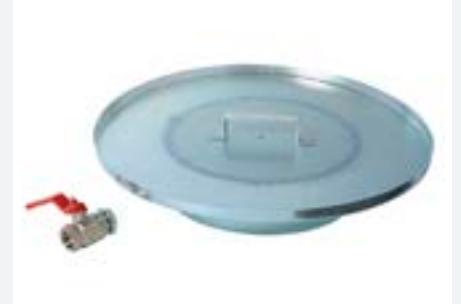
Grill and valve for separating solids from liquids inside the container