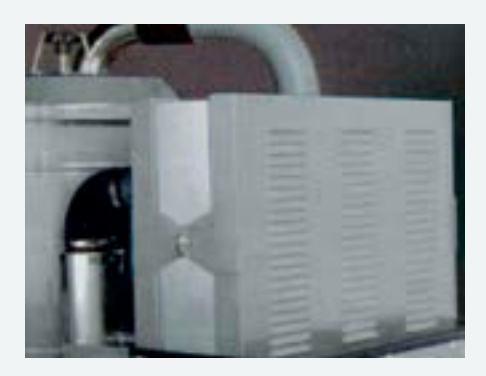
Absolute exhaust air filter