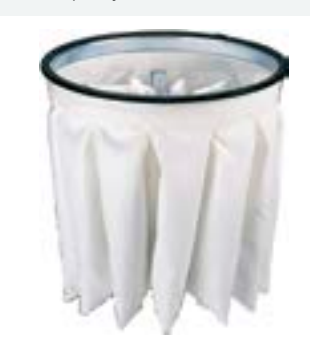
Standard star filter