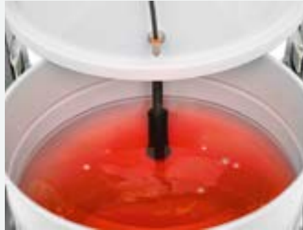
Liquid cut-off system