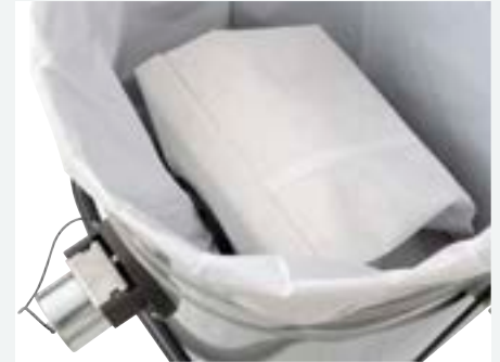
Safe bag for toxic material