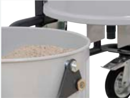
Solid cut-off system