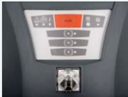
Electronic board control