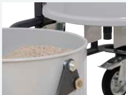
Solid cut-off system