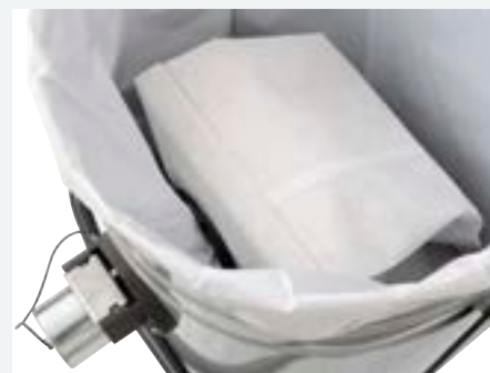
Safe bag for toxic material