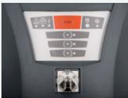
Electronic board control