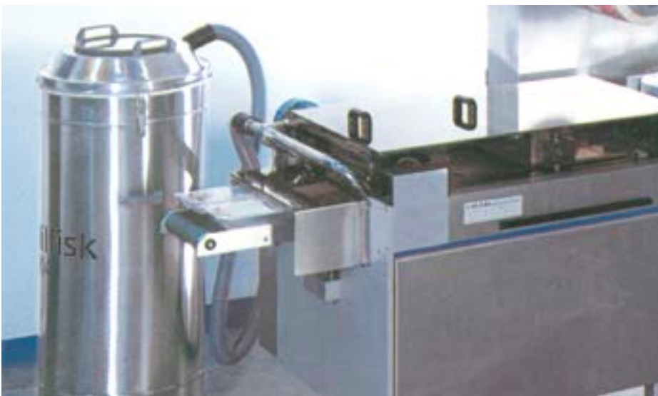
Collection of trims from packaging machine.