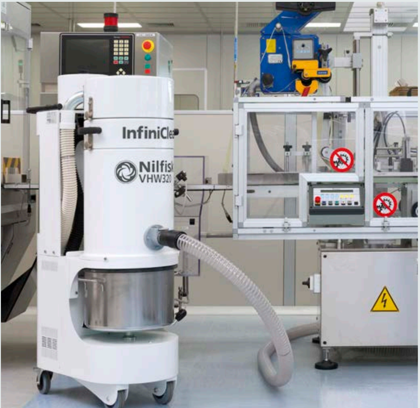
VHW320 with infiniClean, the innovative automatic and stand-alone cartridge filter cleaning system