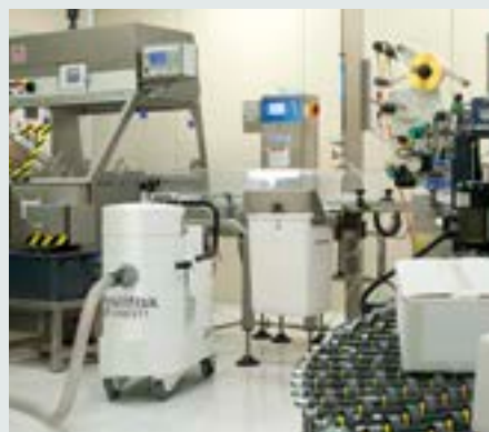
Recovery of waste from a packaging machine