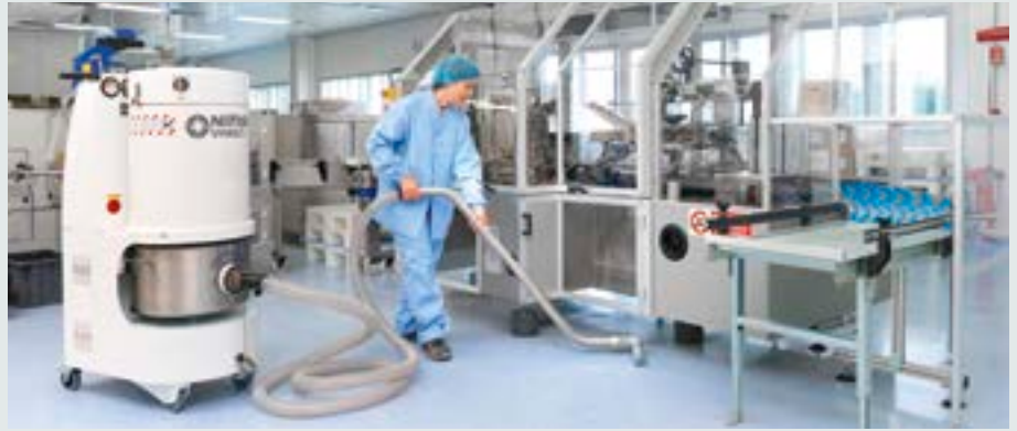
General cleaning of the lab