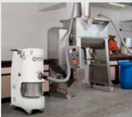
Daily cleaning of driers