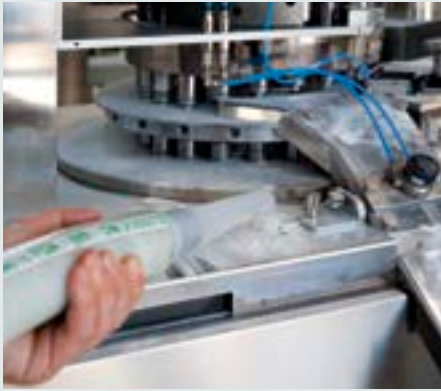
Cleaning of a processing machine