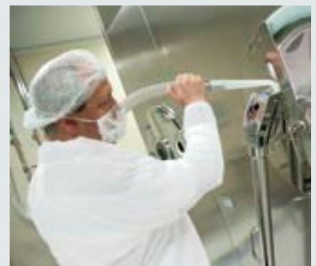
Cleaning of a coating pan