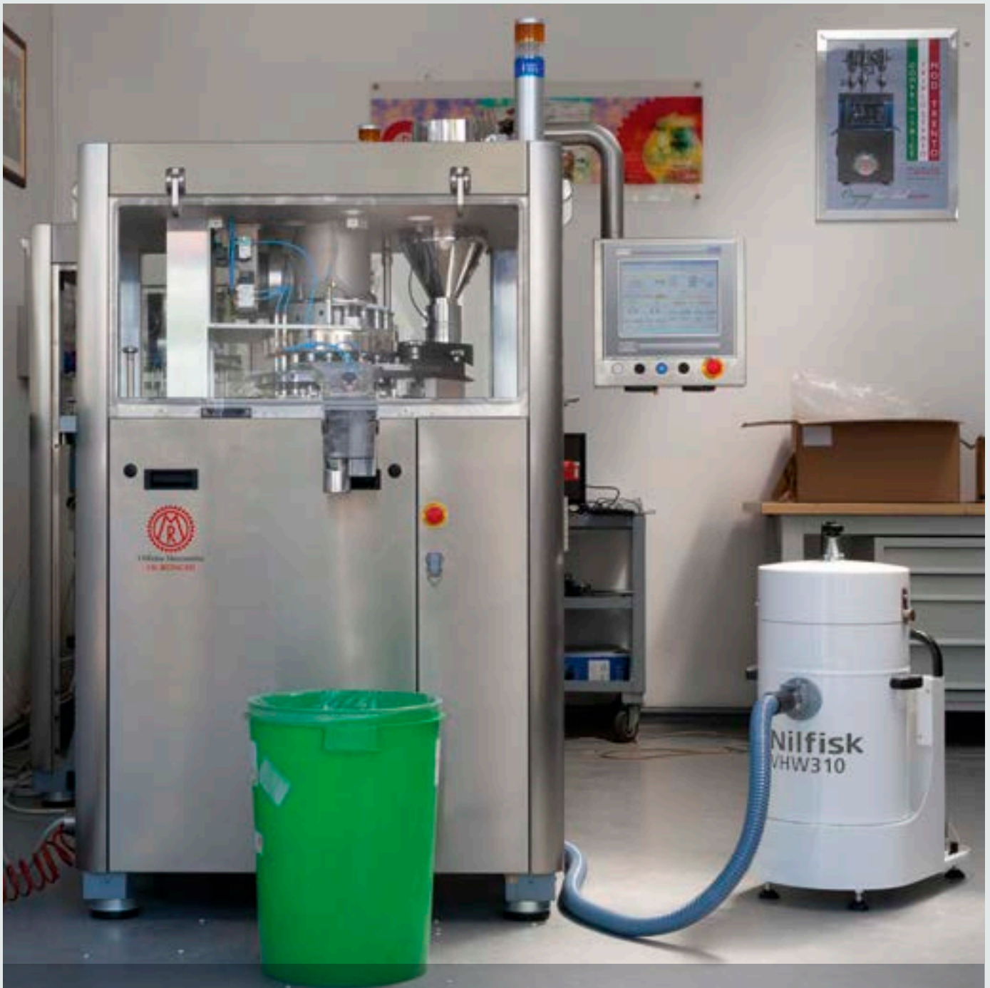
Fixed vacuum on tablet press machine.