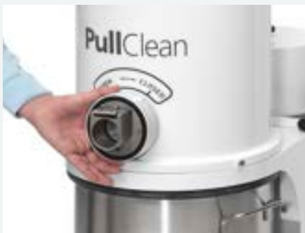
PullClean filter cleaning system