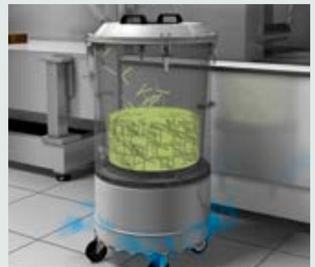
To exploit the total container capacity, trims are progressively compacted on the bottom of the container