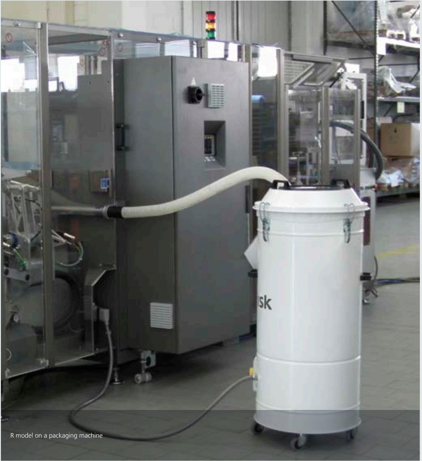
R model on a packaging machine