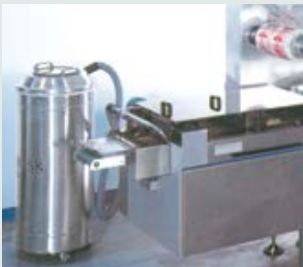
Collection of trims from packaging machine