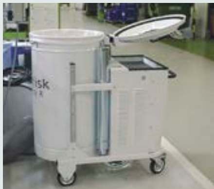
Power and capacity in a trim-extractor