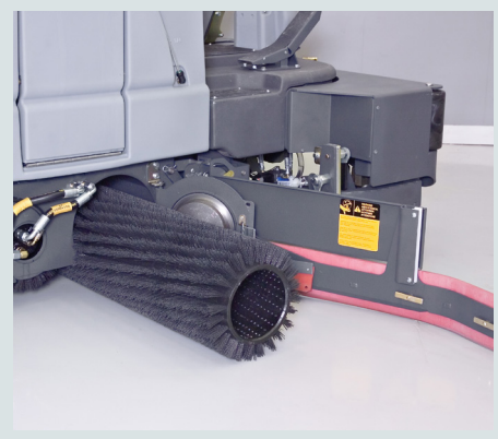
Maintenance is quick because replacement and adjustment of squeegee blades, side blades, and brushes require no tools.