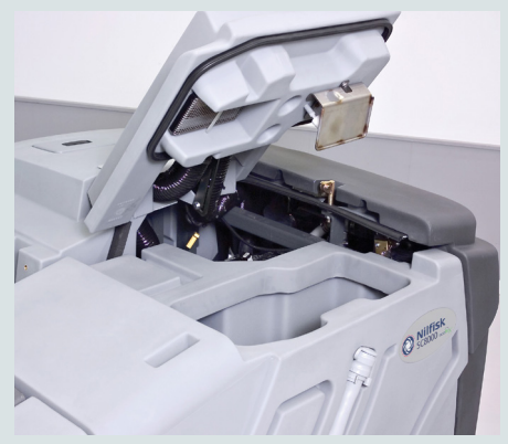
Cleaning of the machine is easy thanks to the tip out recovery tank opening with debris tray.