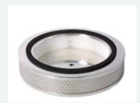
HEPA absolute filter on model T40W