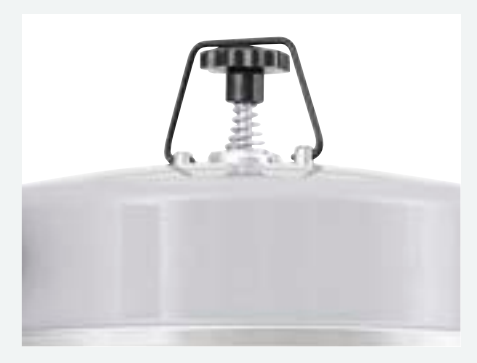
Manual filter shaker