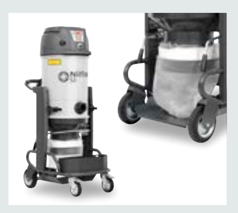
S3 with gravity unload system with Longopac®