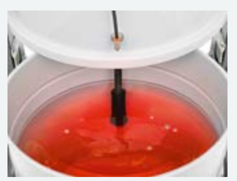
Liquid cut-off system